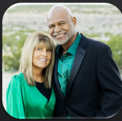
Restoration in the Son Ministries International

CALDWELL SDA CHURCH 2106 E. Linden Street Caldwell, ID 83605 (208) 459-2451